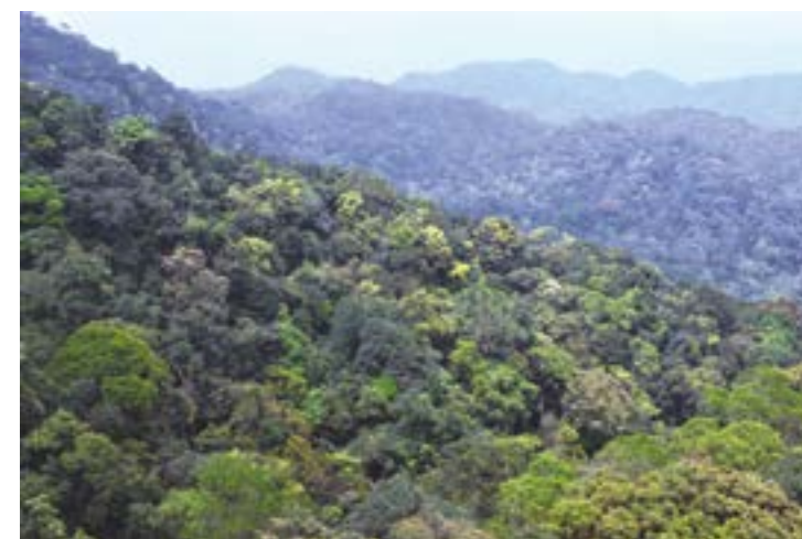
Fig.2. Lower montane evergreen forest at Ba Na-Nui Chua Nature Reserve.

The main vegetation types at BNNC are lowland evergreen forest (<1,300 m asl) and lower montane evergreen forest (>1,300 m asl) (Fig. 2). Dipterocarpaceae dominate the lowland evergreen forest, but are absent in the lower montane evergreen forest, which is characterized by Fagaceae, Lauraceae and Podocarpaceae (Hill et al.1996).