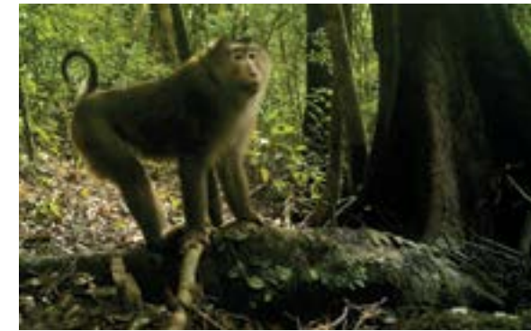
Fig.7. Camera trap shot a northern-pig-tailed macaque ( Macaca leonina ).